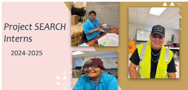
Central Consolidated School District Project SEARCH