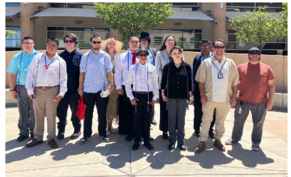
UNM Hospital Project SEARCH