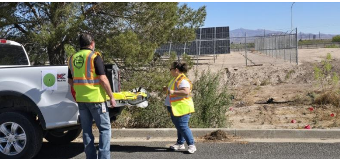
Grounds Upkeep Station