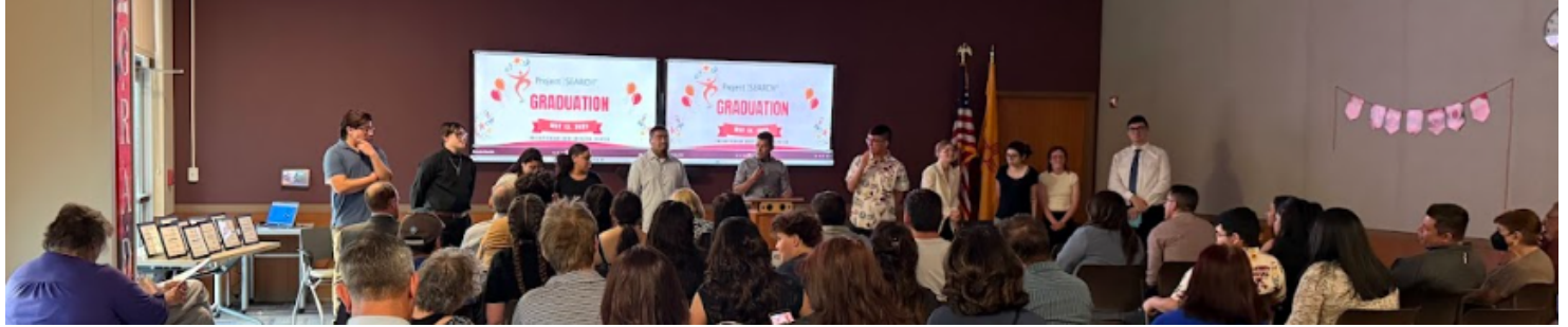
Presbyterian Rust Medical Center Project SEARCH

May was a month full of celebrations, happy tears, and community unity at Project SEARCH graduations across the state. Nearly 50% of this year's graduates have already secured competitive, integrated employment! Many have gone on to get their driver's licenses, moved into their own places, and enrolled in college courses. Please enjoy the below photos and videos highlighting our graduates. Click on the links under the pictures to enjoy more Project SEARCH memories from 2025.