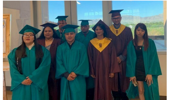
The Hive Education Project SEARCH