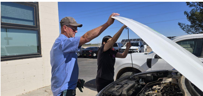
Oil Check Station