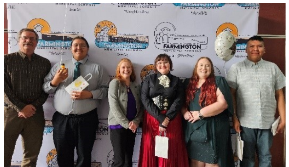
City of Farmington Project SEARCH