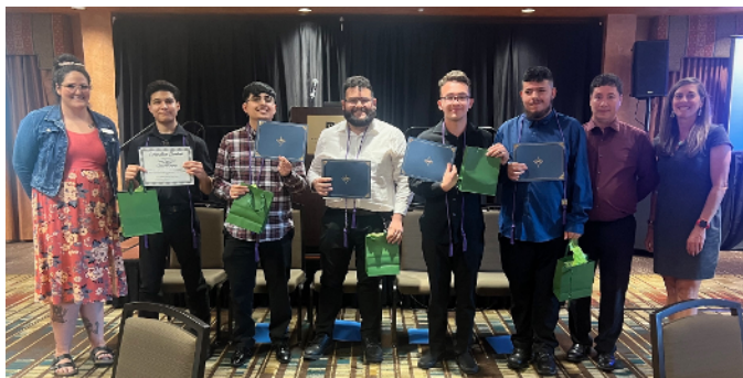
Embassy Suites Project SEARCH