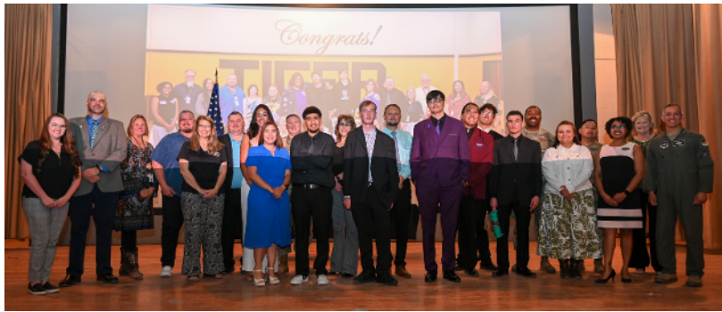
Holloman Air Force Base Project SEARCH