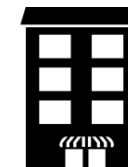
Conduent Financial Management Agency (FMA)