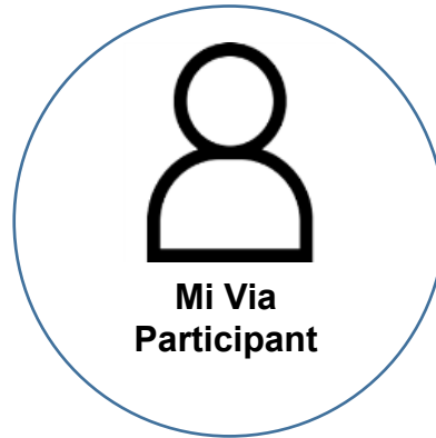
Mi Via Participant