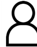
Authorized/Personal Representative(s) (optional)