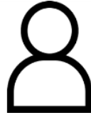
Employer of Record (EOR)