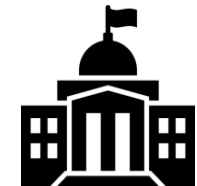
Income Support Division (ISD)