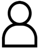
Mi Via Consultant

Questions? Call us. UNM CDD Mi Via Consultants 866-383-3820 Fax: 505-272-5883 www.cdd.unm.edu/mivia